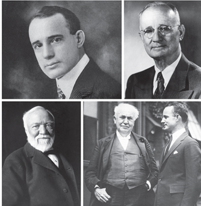
Clockwise from top left: Portrait of Napoleon Hill as a young man, as featured on the cover of Inspirator International magazine; Hill later in life; Hill with inventor Thomas Edison; Hill's mentor and supporter, Andrew Carnegie, who was the world's richest man at the time.